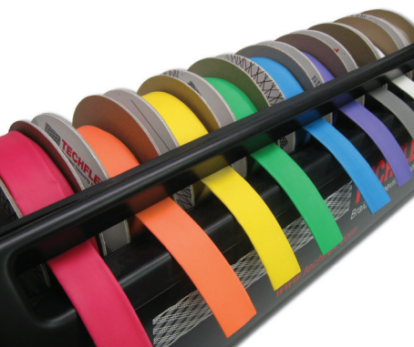
Shrinkflex shop spools fit into our dispenser kit (pg. 101) for easy storage and organization.

When economy is priority, 2:1 Shrinkflex heatshrink tubing is the answer. Not as versatile as a high ratio shrink product, 2:1 will still slide easily over small inline splices and connectors and provide a tight seal in many applications.